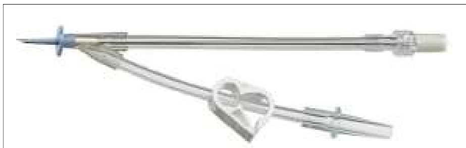
Figure 2. DLP cannula

Once the DLP cannula is in place and open to air, the cardiothoracic surgeon announces that the aortic arch is vented, at which point the NRP pump may begin. The time will be recorded on the National DCD Heart Passport. If there is copious arterial bleeding from the DLP cannula, the NRP pump must stop and the clamp on the descending aorta must be re-positioned to occlude the aorta. Only then can the NRP pump re-start.